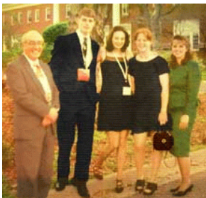
Whitney and RI delegation at the National 4-H Center.