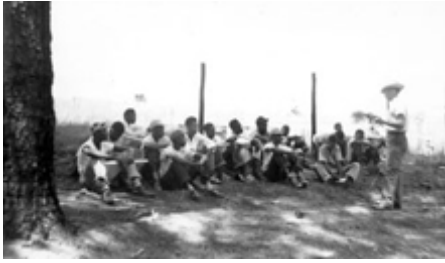
Marks participating in Soil Conservation Camp as 4-H member.