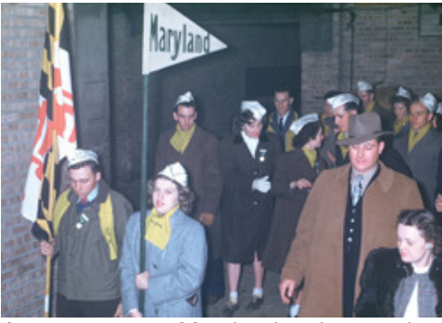
Amy represents Maryland at the opening of National 4-H Club Congress.