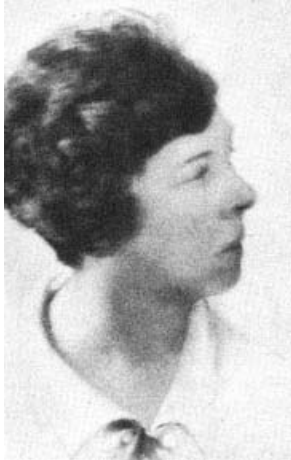
Hometown: Victor, Iowa Nominated by: CSREES/USDA Year Inducted: 2002