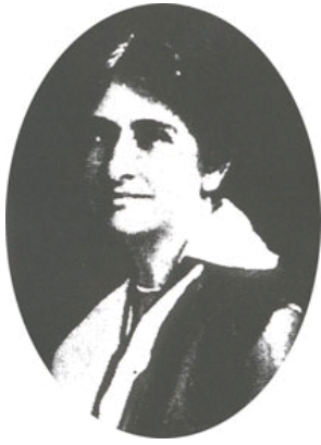
Home: Georgia Nominated by: CSREES/USDA Year Inducted: 2002