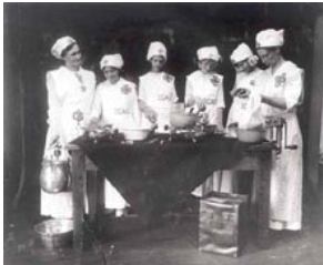
A canning club receives training - 1917.