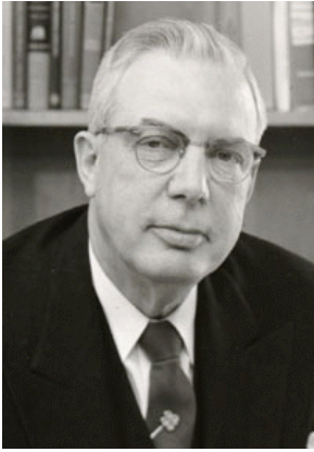
Hometown: State Center, Iowa Nominated by: CSREES/USDA Year Inducted: 2002