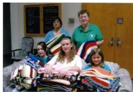
Club making Lap Robes for Veterans (2009).