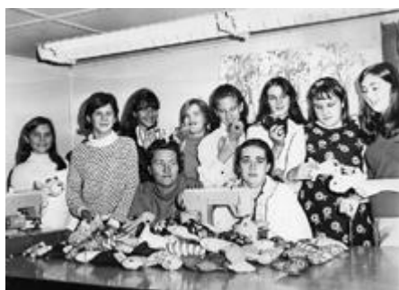
Making Christmas Projects for Nursing Home (1969)

Looking back at 67 years as a volunteer leader - what wonderful rewarding years. I have taught numerous youth (too many to remember) life/basic skills to help prepare them for their future. My motto has been "you can do anything you want to do if you want to do it" and "where there's a WILL there's a way!"