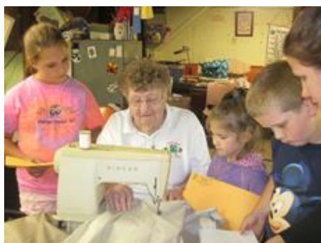
Club members learning basic sewing skills (2019).