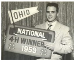
National 4-H Winner, 1959

Quote: In 1958, I wrote in my Ohio 4-H Report Form, "I am proud to be a part of 4-H today and hope that in the future I may serve 4-H in some capacity". The next year, I attended National 4-H Congress and was named National Beef winner. Following Congress, A.B. Graham, founder of 4-H, sent me a hand-written letter of congratulations which he concluded by writing, "The sun never sets on 4-H Club work. Be proud you are one of the many millions." I am proud of the journey, and honored to be inducted into the National 4-H Hall of Fame.