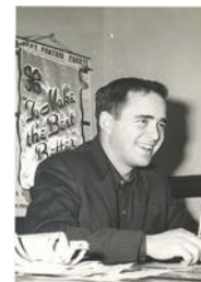
Madison County, Indiana 4-H Youth Agent