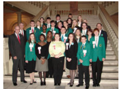
Commissioner Irvin poses with honorees at 4-H Day at the Georgia Capitol